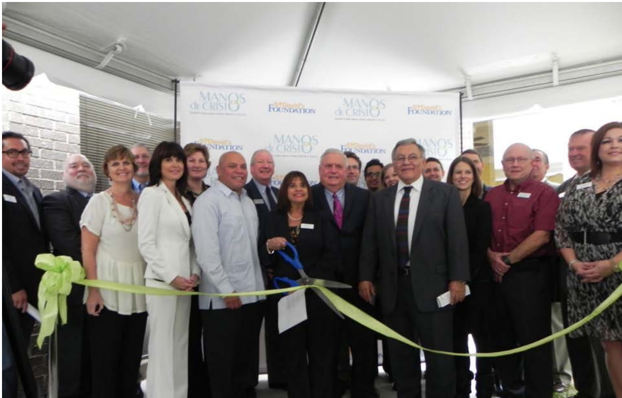
Dental Center Grand Opening and Ribbon Cutting 2013